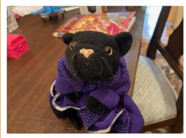
♥ General Velvet on front lines. ♥