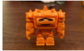
CHUNK, FROM TOY STORY 3, ON THE FRONT LINES