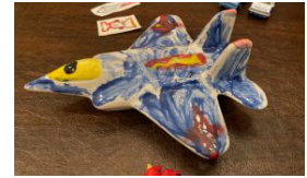
A BOMBER ON THE FRONT LINES