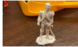
THE FAMOUS GENERAL, ALSO ON THE FRONT LINES