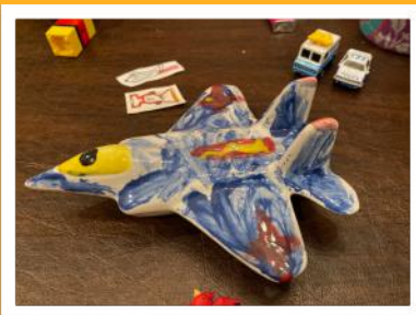
A bomber on Front Lines.