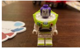
BUZZ LIGHTYEAR ON THE FRONT LINES